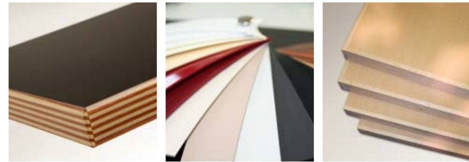
LTRONIC LASER EDGE UNIT

LTRONIC und GLU JET – for superior edge appearance.